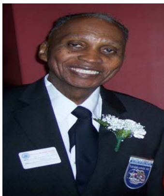
William A. Samber, Sr. “Original Tuskegee Airman” Aviation/ Math and Science Scholarship