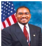
Congressman Gregory Meeks U.S. 6 th CD

This year the most important education bill that will be considered is the reauthorization of the Elementary and Secondary Education Act of 1965 otherwise known as No Child Left behind (NCLB). Currently, states that were in jeopardy of failing to meet the goals set forth in NCLB are seeking waivers for the department of Education until Congress can agree to a reauthorization bill. While I was hopeful for a reauthorization under regular order, however, in my work with the Congressional Black Caucus Education Task force it is increasingly Continues on P. 6