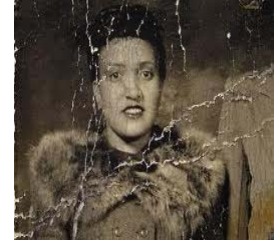
Henrietta Lacks 1920-1951

She was an African-American woman whose DNA was taken, unbeknown to her, more than 60 years ago. Her cells became an immortal cell line used in medical research.