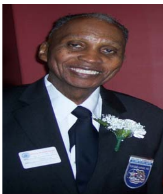
William A. Samber, Sr. "Original Tuskegee Airman" Aviation/ Math and Science Scholarship