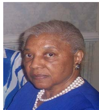
Hon. Ernestine Washington Library Science/ English Language Arts Scholarship