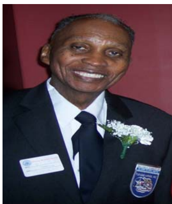
William A. Samber, Sr. "Original Tuskegee Airman" Aviation/ Math and Science Scholarship